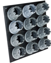
Option : WP-12PDR